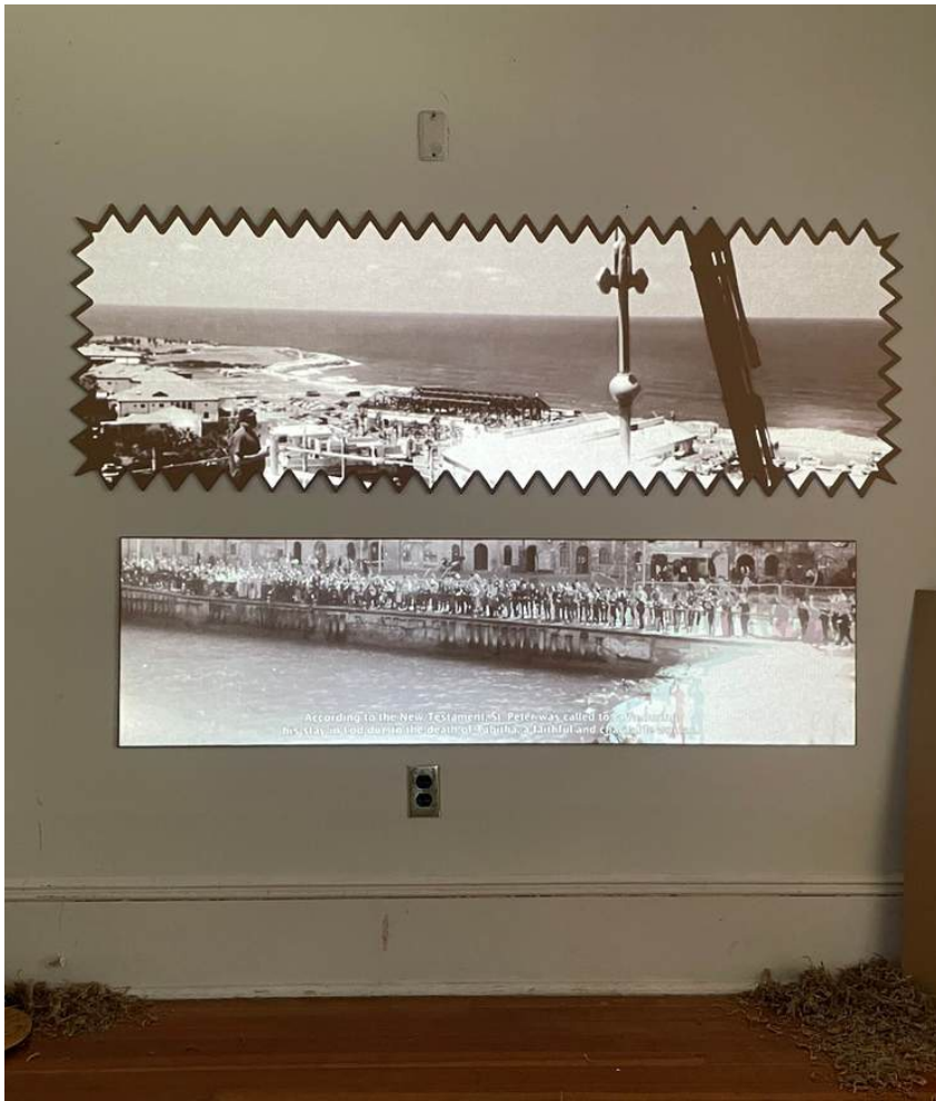
Epiphany_B-side 2024 Mixed-media installation Dimensions variable