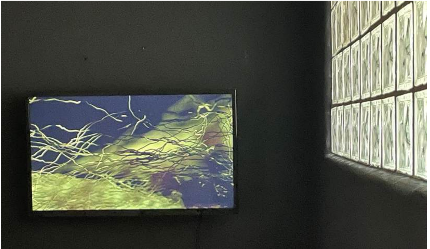
How Did Daphne Turn Into a Plant (Our feet, just now so swift, hold fast in resistant roots) 2022 3D animated film 12:35