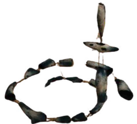
Coil Felt, yarn 120 x 36