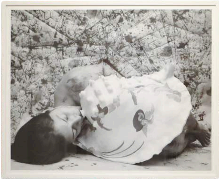
Shell Mother Black & white medium format photograph 32 x 41" 2024