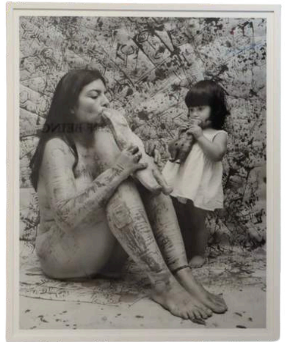
Umiñas Black & white medium format photograph 32 x 41" 2024