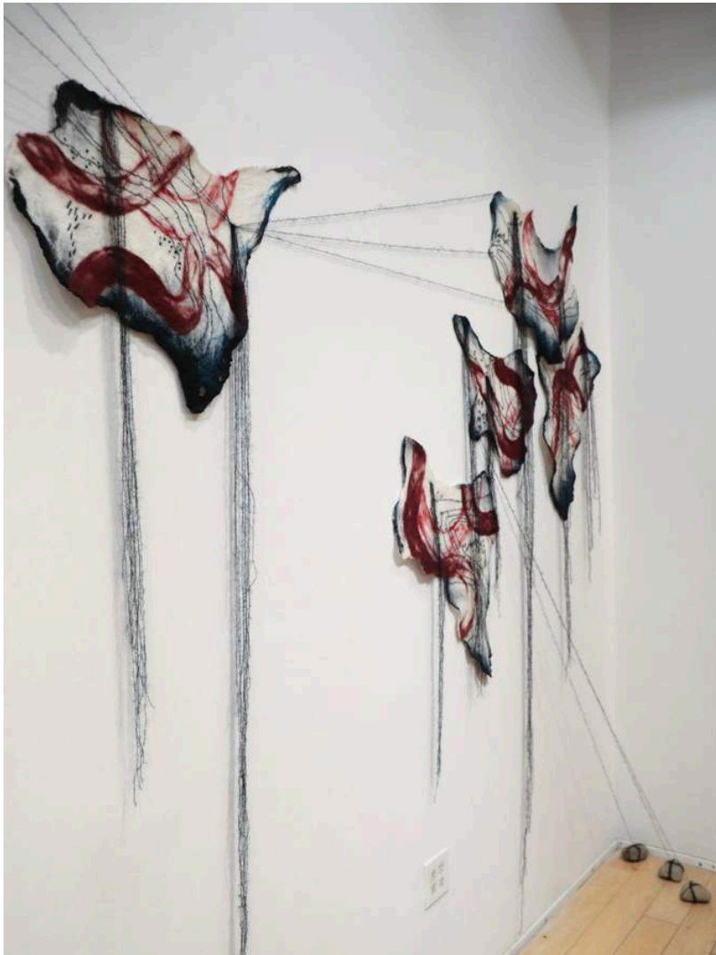
ReWorlding Felt, yarn, rocks 84 x 96 x 36" 2024