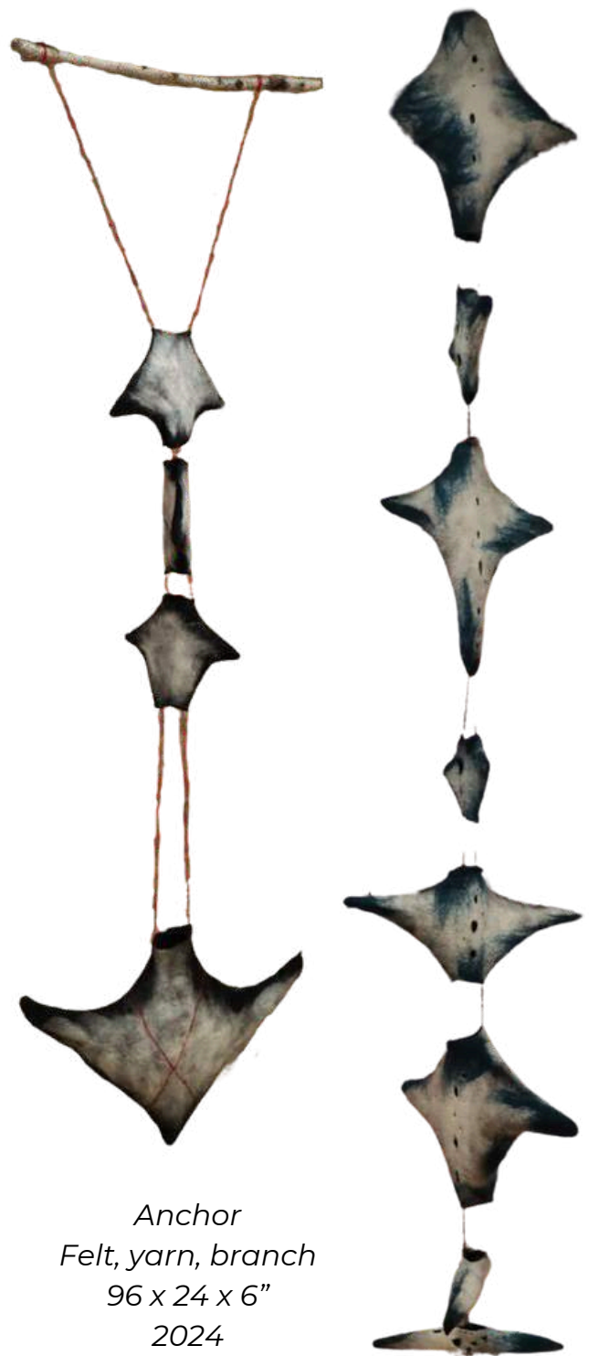
Anchor Felt, yarn, branch 96 x 24 x 6" 2024