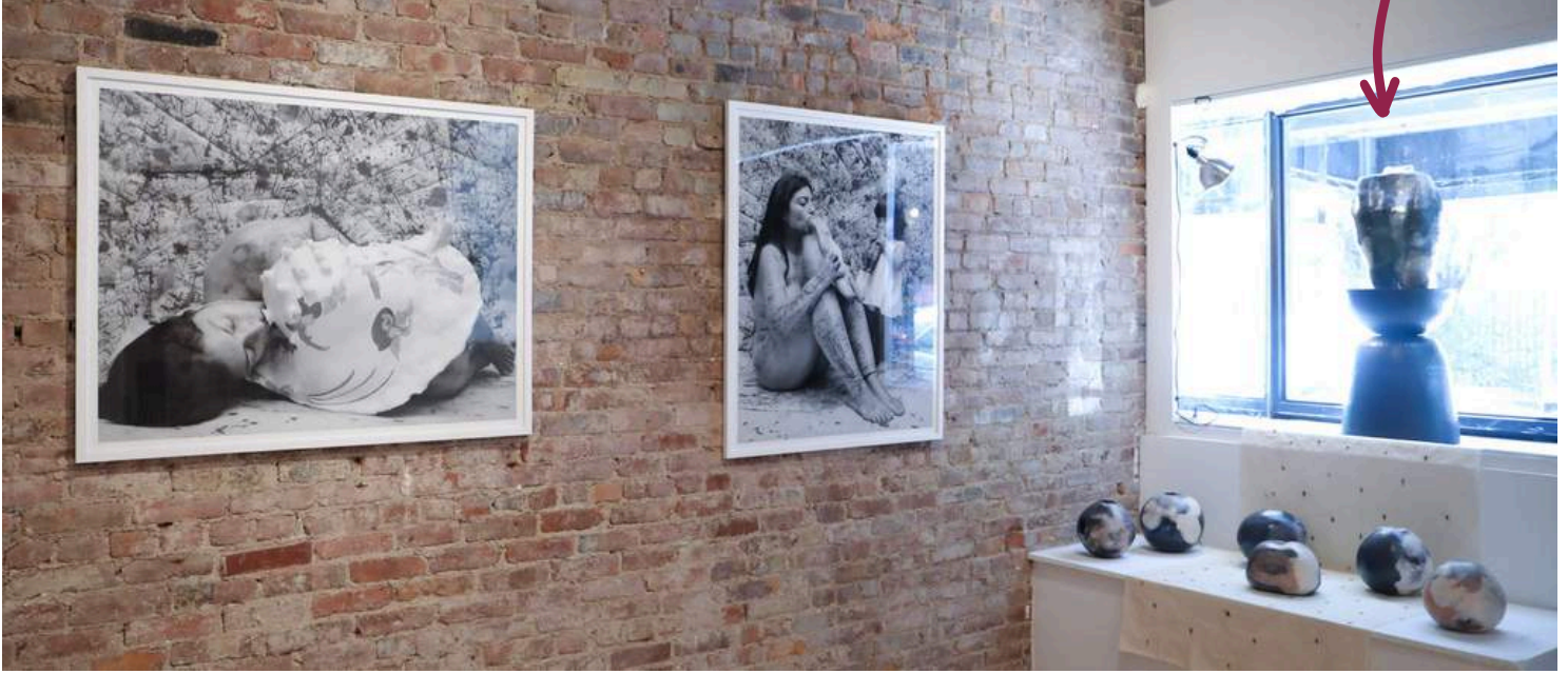
Flute Being Pit fire ceramic and metal 14 x 42" 2024