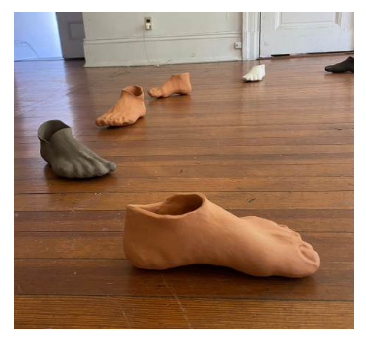
Feet of the World details

Ceramic, gold sleeve, glass, and paper Dimensions variable