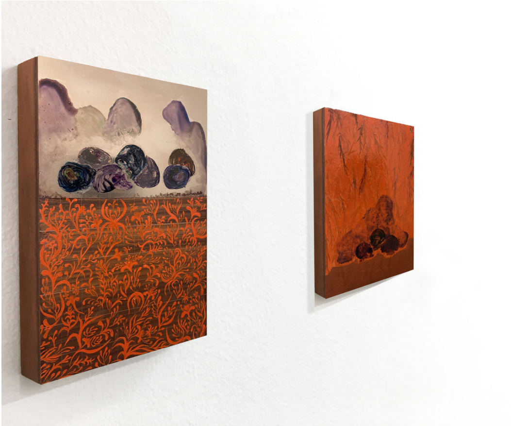
Installation view - Elisa Bertaglia, A Dance, 2023, oil on rose gold, 6x4 in each

Thursday February 15, 2024 | 1:00 - 2:00pm