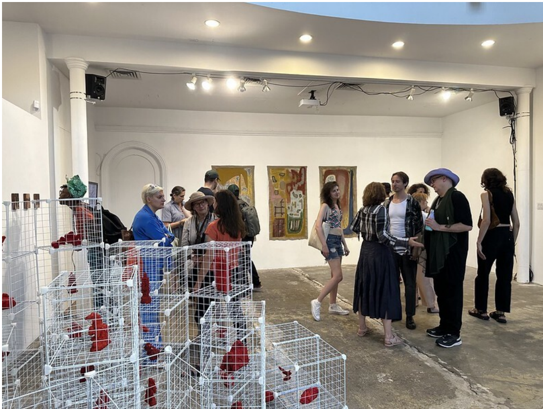
"METAPHOR-MOSIS" group show at Residency Unlimited, curated by Ru Marshall