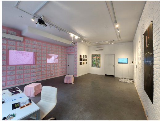
Installation shot, "...an instinct to change things..." group show curated by Alexis Mendoza, Trotter & Sholer