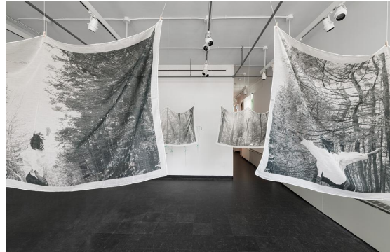
Miatta Kawinzi, "to trust the air might hold us", 2023, Photographic prints on fabric