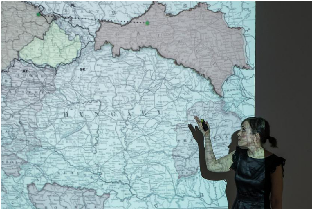
Michelle Levy, "She is alone", 2017. Performance lecture with participation presented by NurtureArt, Brooklyn.

Thursday November 30, 2023 | 6:30 - 8:00pm