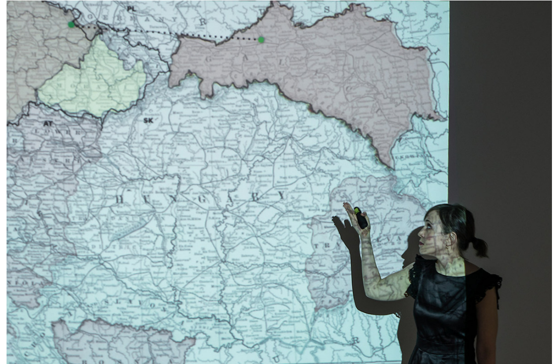
Michelle Levy, "She is alone", 2017. Performance lecture with participation presented by NurtureArt, Brooklyn.

Thursday November 30, 2023 | 6:30 - 8:00pm