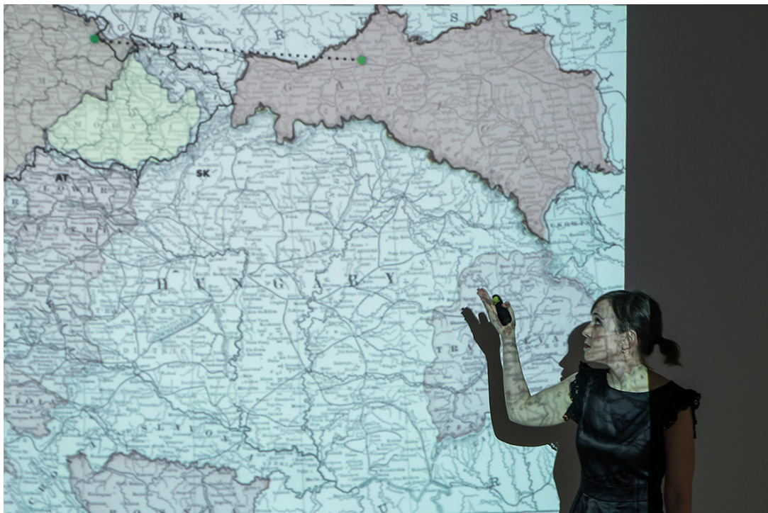
Michelle Levy, "She is alone", 2017. Performance lecture with participation presented by NurtureArt, Brooklyn.

Thursday November 30, 2023 | 6:30 - 8:00pm