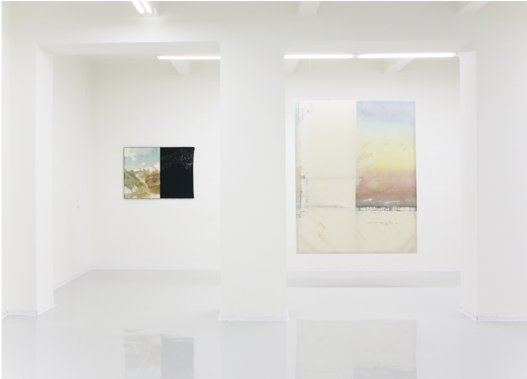
View of the exhibition: Žofia Dubová - Somewhere Between Place and Painting, 2023, ©Ernest Zmeták Art Gallery

Monday November 27, 2023 | 1:00 - 2:00pm