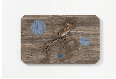
Ádám ALBERT: Site Plan, 2023, marble inlay, 59 x 96,5 x 3 cm