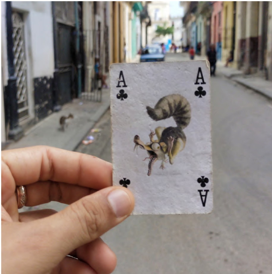
Playing card found at Villegas and Obrapia, June 30th 2023 - Documentation of found objects from the series Itineraries