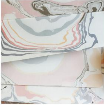
10-21 Suminagashi Paper Marbling with Hayley Ferber