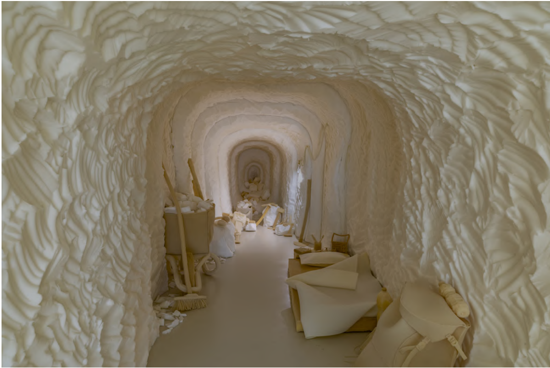
Dina Shenhav, "Tunnel", foam, glue, and wood, 1800 x 240 x 300 cm, 2020.