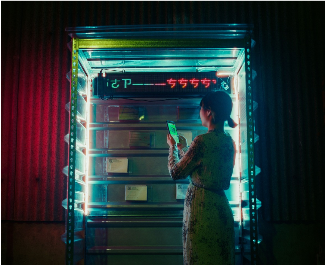
Chang Yen-Tzu, "The Tin House in Shezidao", presented in We the Shezi Fest, 2022: lóo-lát ©Mutualism

Wednesday September 27, 2023 | 1:00-2:00pm