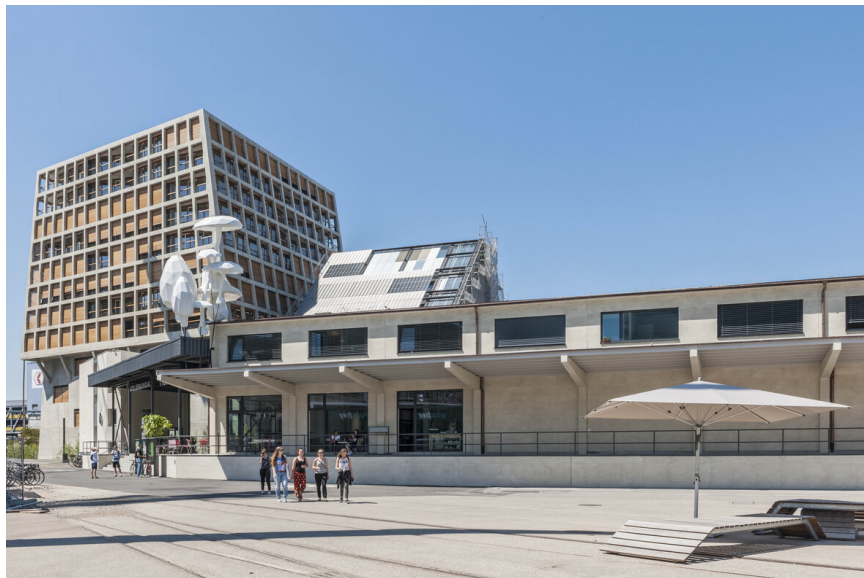
Atelier Mondial, outside view, 2021.

Deadline: Sunday October 1, 2023 | 11:59pm Eastern Time