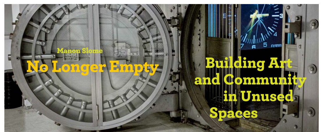
Orit Ben Shirit, "Vive le Capital" (2010-12) Video Installation in the safe of the former Bank of Manhattan, Long Island City, Queens.