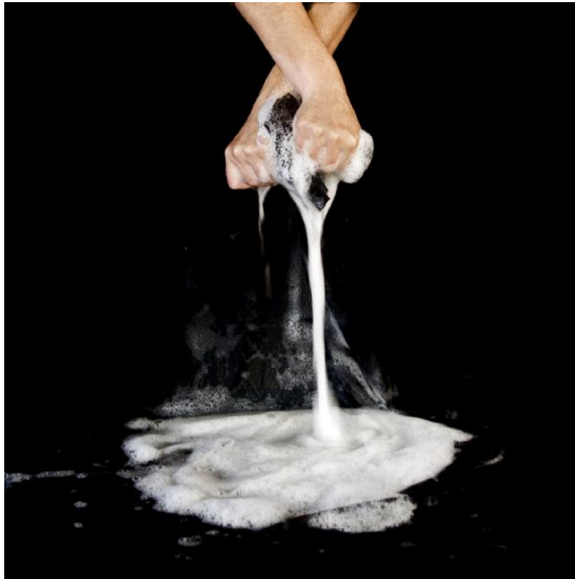
Amira Ziyun, "Shirin", photography, 100x100cm, 2017.