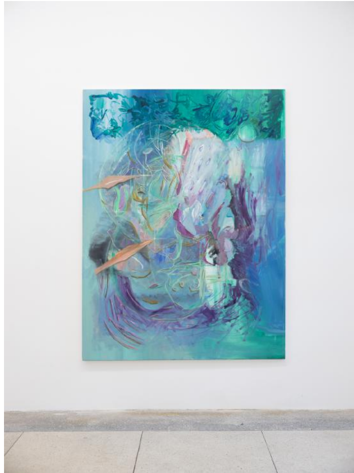
Aurelija Bulaukaite, "Me after wearing a cute outfit on a boring day", oil on canvas, 152 x 203 cm, 2023

interpretation to enable the option of self-intervention.