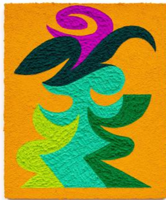
Carlos Rosales-Silva, Plastic Flower Power, 2023, Crushed stone and glass bead in acrylic paint on panel, 24 x 20 in.

As the protagonist of this year's exhibition for the Polish Designs Polish Designers series, the Gdynia City Museum has chosen Jakub Szczęśny (2013 RU alum) whose multifaceted work will help us delve into the larger question of design and society. More info here .