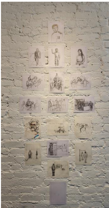
In between transition Drawings on paper, 2018-2023