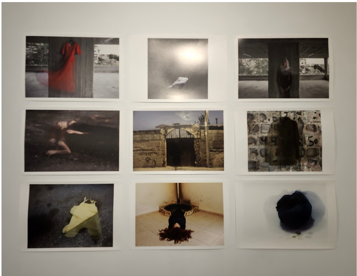
Works from portfolio, 2016-2020