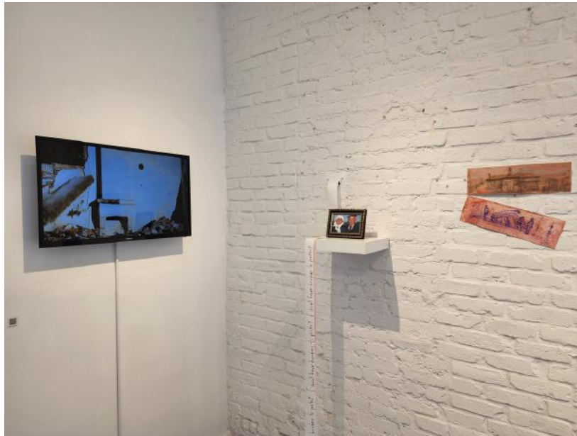
Partial installation shot