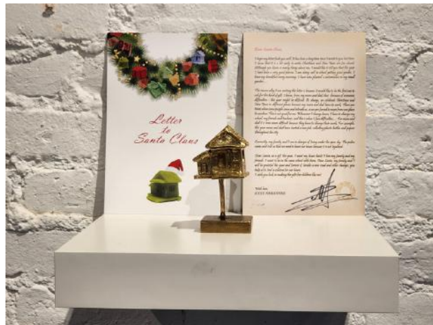
"Shtepizeza" 2014-2023, Small house, Home sweet home, multimedia installation, bronze, 2x2x2 inches, 2014-2023