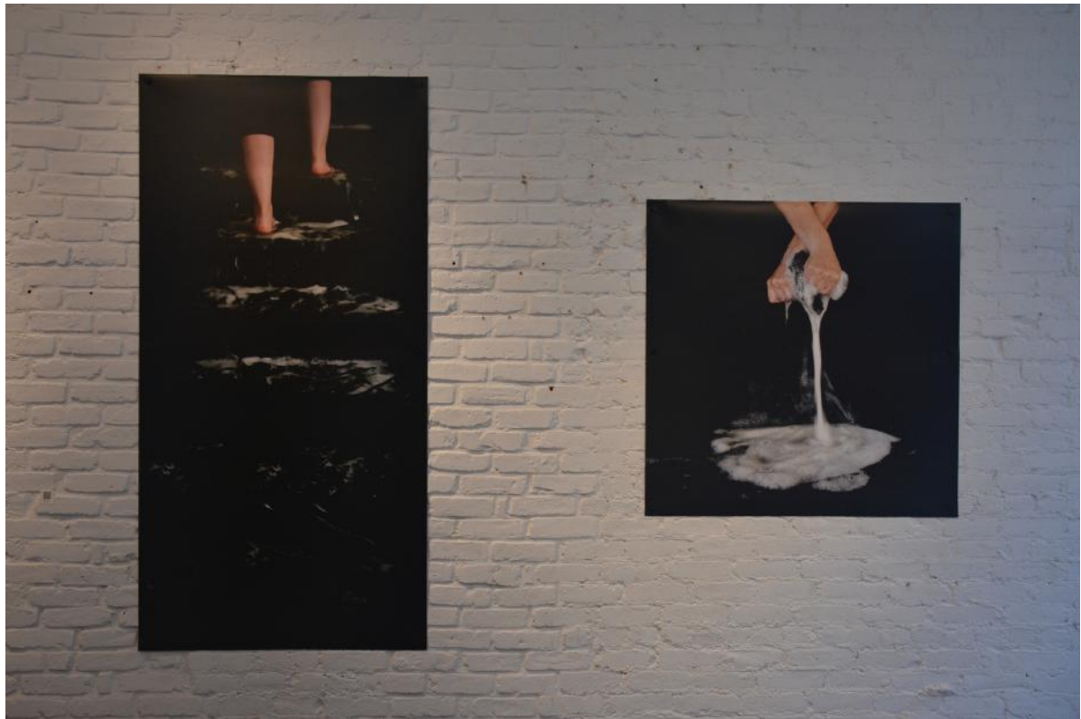
Left: Stairway To Heaven, 70x35 inches, 2017. Right: Shirin, 40x40 inches, 2017