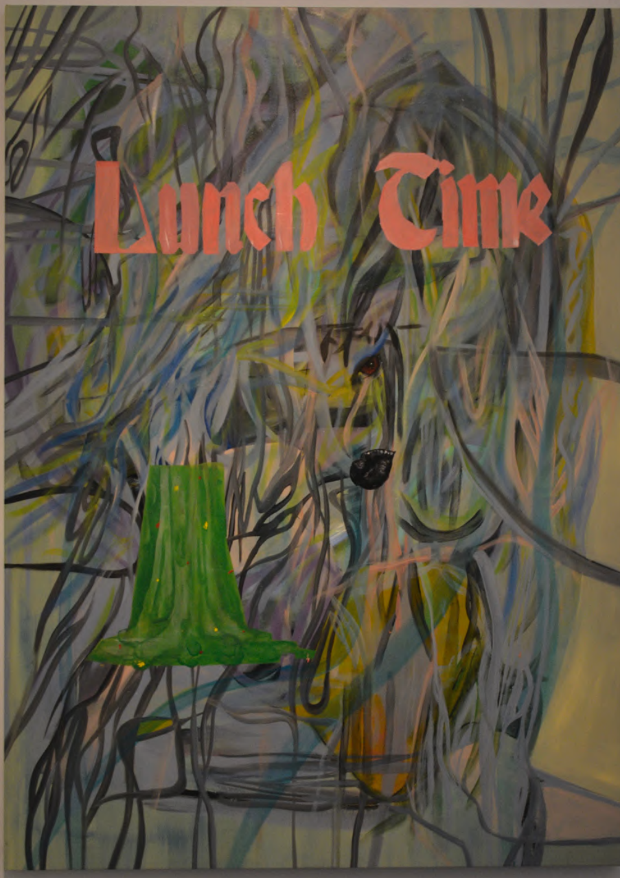
gastronomic glamour, oil on canvas, 57x41 inches, 2023