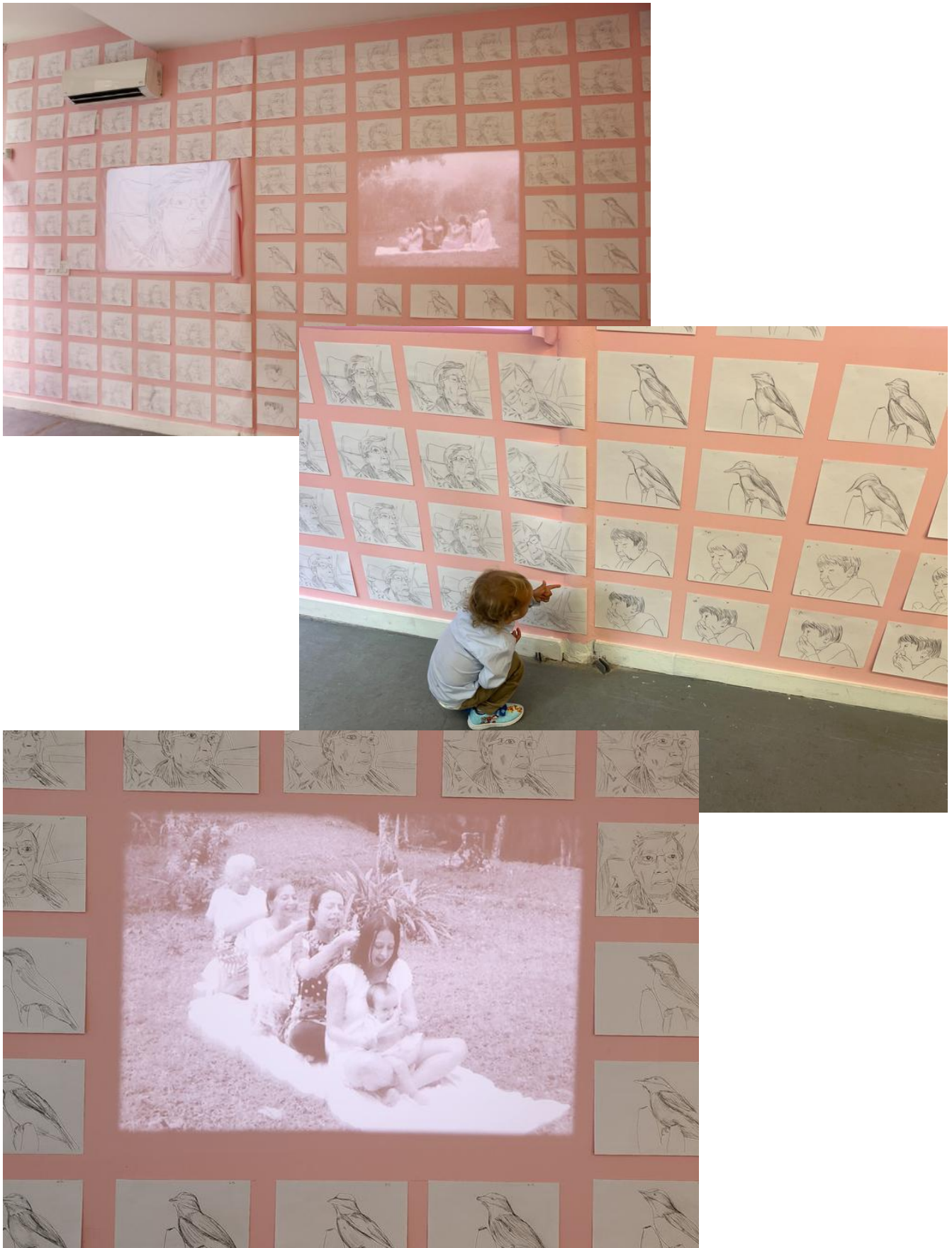
Nanita, para siempre & Braiding the future, installation with two video projections, stereo sound, 2023