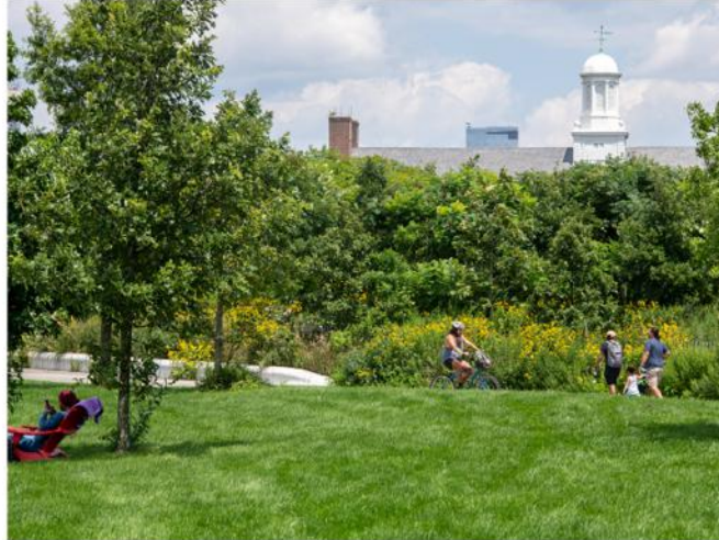
Govs Island's climate-resilient park, open daily from 7am-6pm, is the perfect spot for biking, strolling, relaxing, urban hiking, and—of course—hammock-ing!