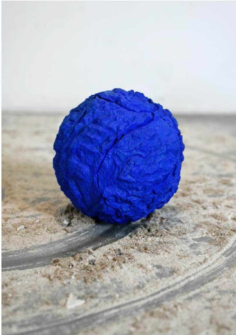
Rafael Villares, details from the series "Echo Atlas".

Opening: Thursday July 13, 2023 | 5:00 - 8:00 pm (RSVP required)