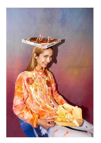
Pauline D'Andigné, Bitter Sweet 5, 2021, digital photography, pearl inkjet paper print, 43,30 x 66,92 inches