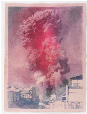
Nazanin Noroozi, "Beirut 200804 #1", from the series This Bitter Earth, 2022, Pigmented linen pulp on cotton base sheet, 40 x 30 inch

adoration of a sculpted Herme. The artist also invites contemporary artists and friends to participate and juxtaposes their new works with old master chef d'oeuvres drawn from various collections.