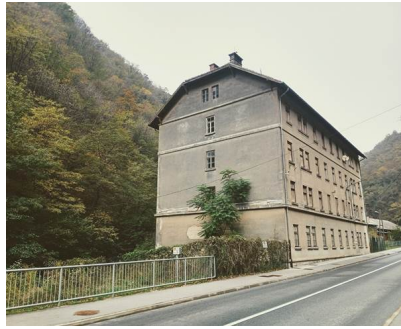
Dejmi Hadrović, The Absence of Presence, 2022