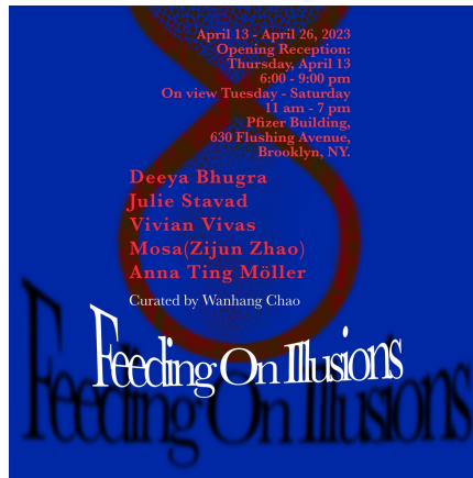
Feeding On Illusions