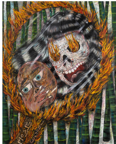
Si On, "Mirror", 2022 Oil on canvas 90 1/2 x 72 7/8 inches