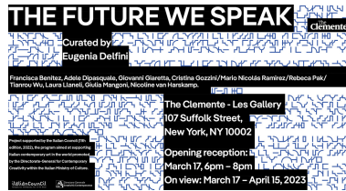
The Future We Speak