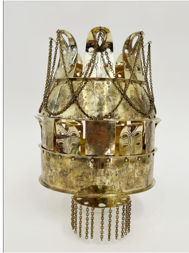
Helina Metaferia, Crown (Sheba), 2023, brass sculpture with etching, 12.5"x8"x8", on view at Sharjah Biennial 15.