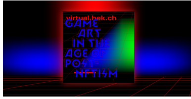
Who Is Online? Game Art in the Age of Post-NFTism