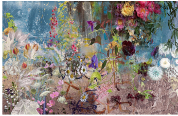
Irene Mamiye, "Homage 2914", 2021. Dibond of aluminum, 22 in x 36in, Ed of 5