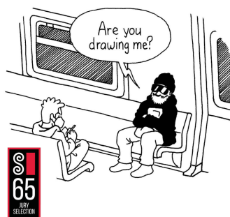
Extract of the series "Subway Encounters", Ink and gouache on paper, 2022