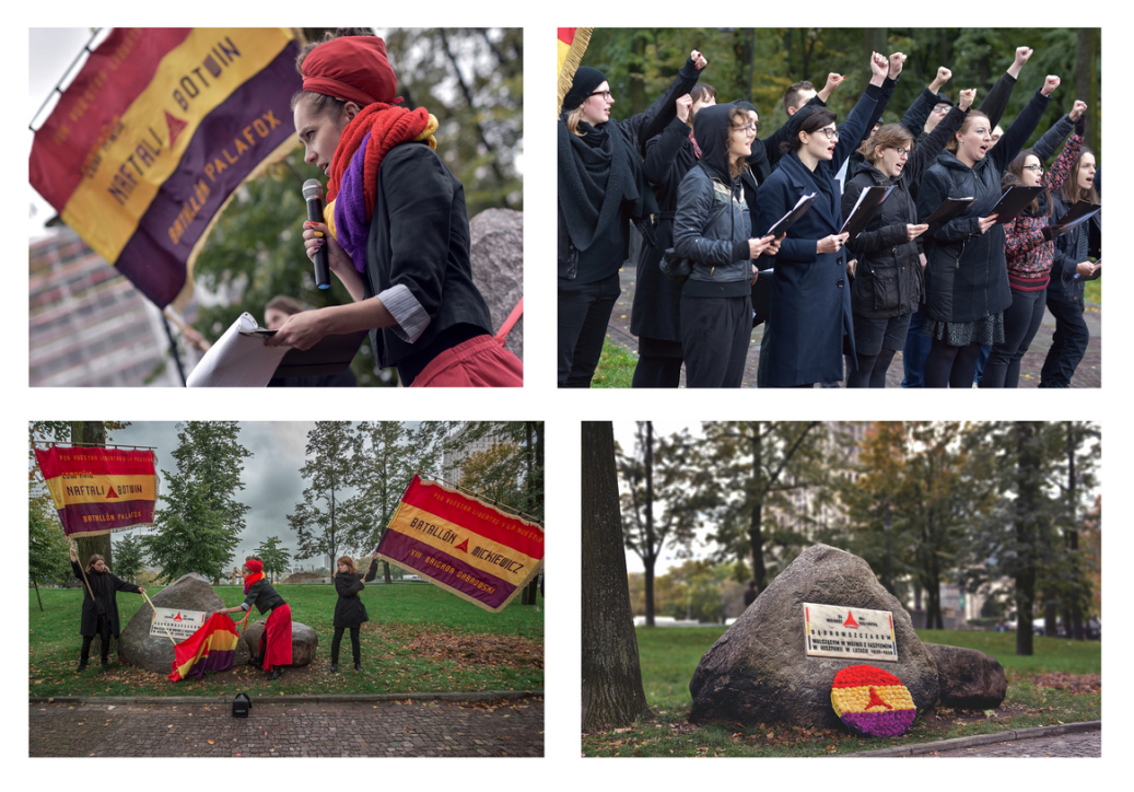
Nomadic Memory, 2017, intervention in a public space, Plac Defilad: a step forward, 9th edition of the Warsaw Under Construction Festival, Museum of Modern Art in Warsaw.

December 13, 2022 | 1:00pm Works on view: 1:00-6:00pm