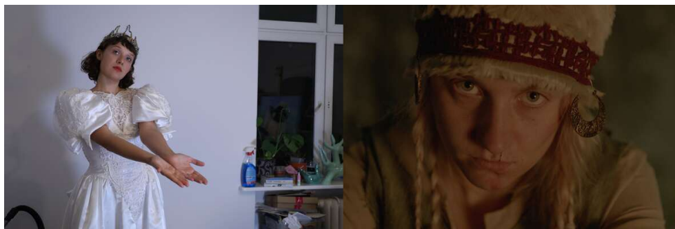
Queen of amber and slavic maid (artists at their work)