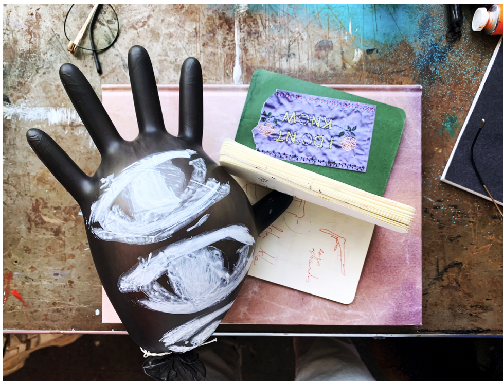
Artists and their work