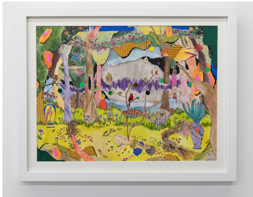
"BowerBird and the Lady's Slippers" 2022. Watercolor and sequins on paper, 31x41cm.