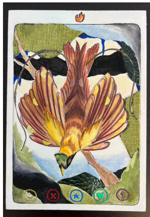
Creator Bird of Paradise on tinder, 2022. Watercolor and sequins