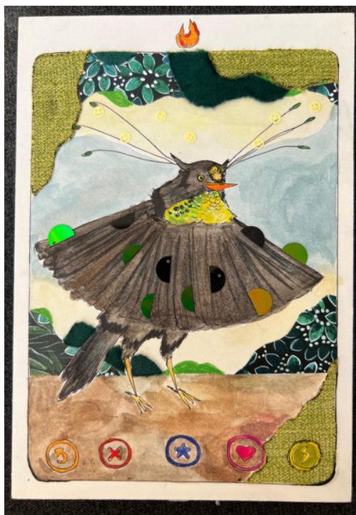
Wahnes Parotia on tinder, 2022. Watercolor and sequins