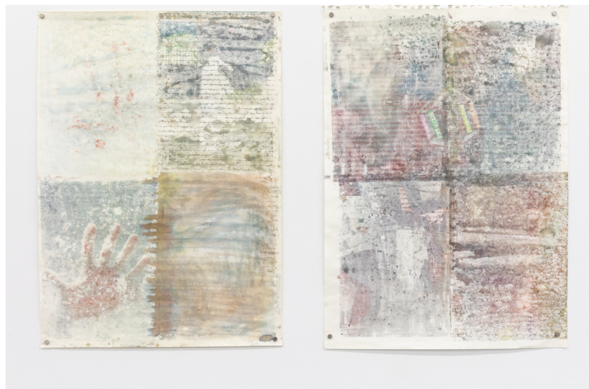
Untitled_1, (Settled Dust) 2021 Printer ink transfer on wet paper, 60x40 cm/23x15 in