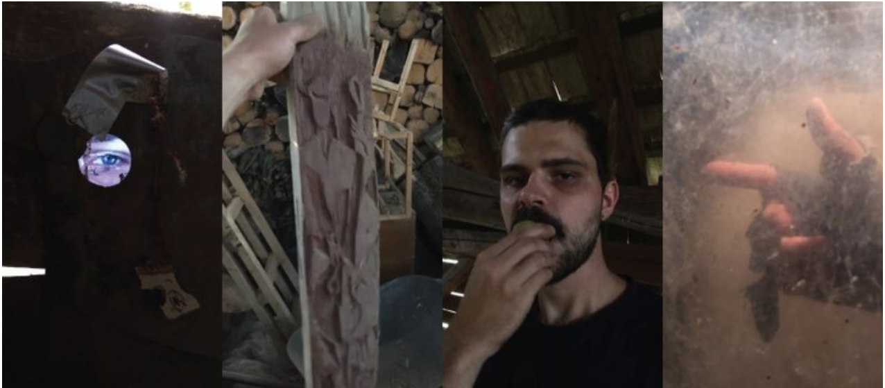
"Beta Ground (Delirium Obstacle)," 2019. Single-channel HD Video. Duration: 0:12:48:29