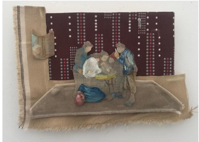
"Fundamentally deceptive stick of the pregnancy test," 2022. Oil on fabric.