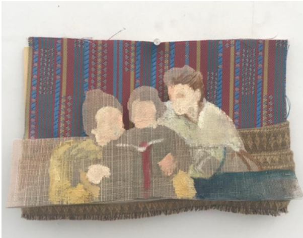
"Bertha Benz plotting to chase fun," 2022. Oil on fabric.