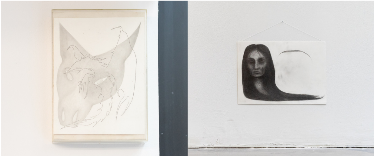
Untitled drawings for Presence, 2022