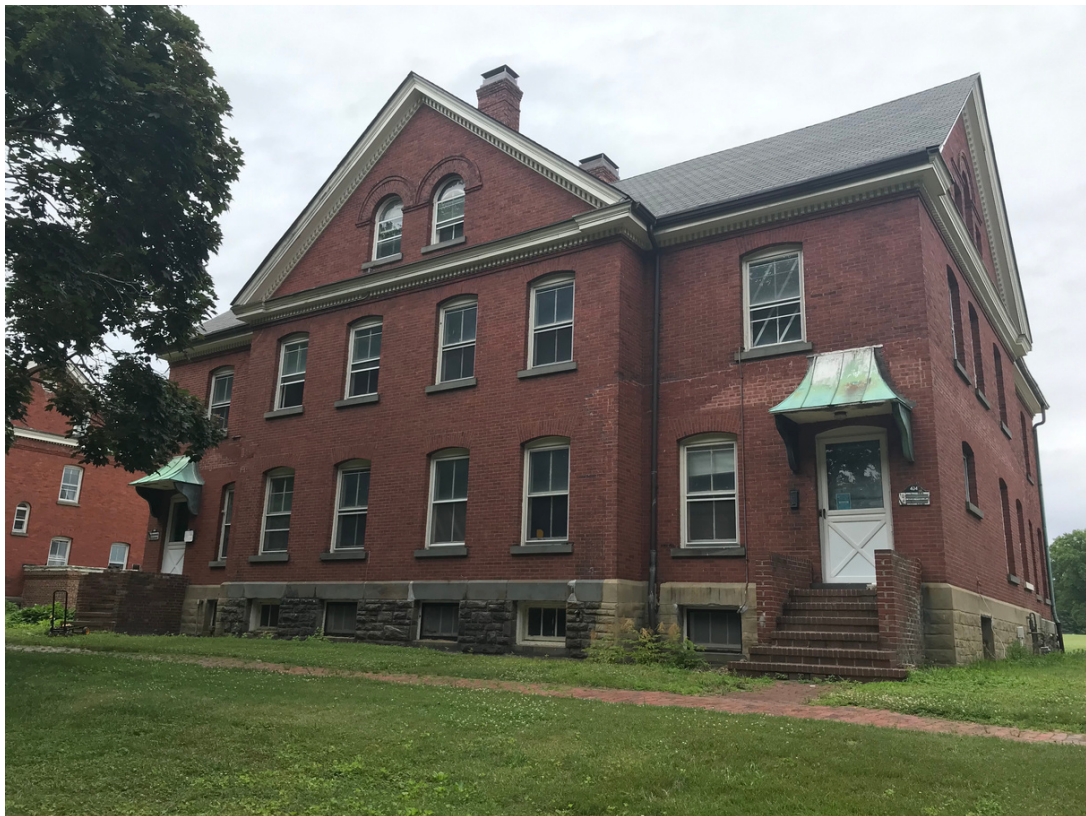
KODA/RU House on Governors Island