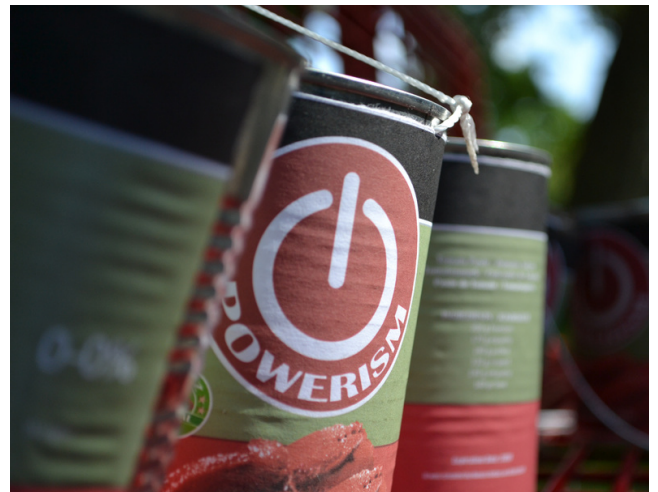
Powerism by Hamza Kirbas, 2022