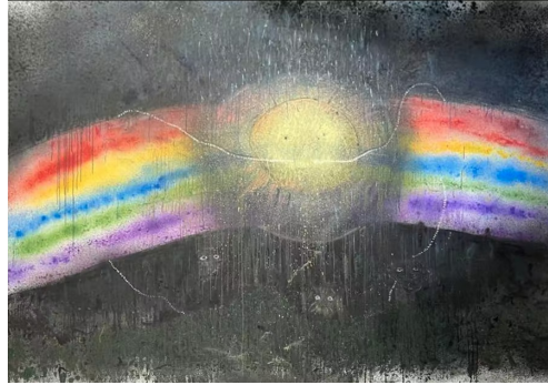
Brilant Milazimi, Yellow Light to cross the rainbow, oil on canvas, 2022