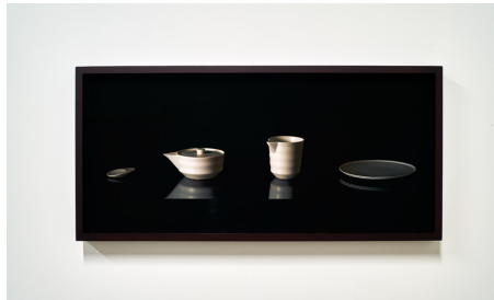
Objects – Department Store Displays, Tokyo – I, 2021, giclee print, 25 x 54.2 cm