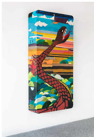
Pedro Wirz, sadnest #1 „Cobra de Rua“ (Street Snake), 196 x 99 x 34 cm, 2022