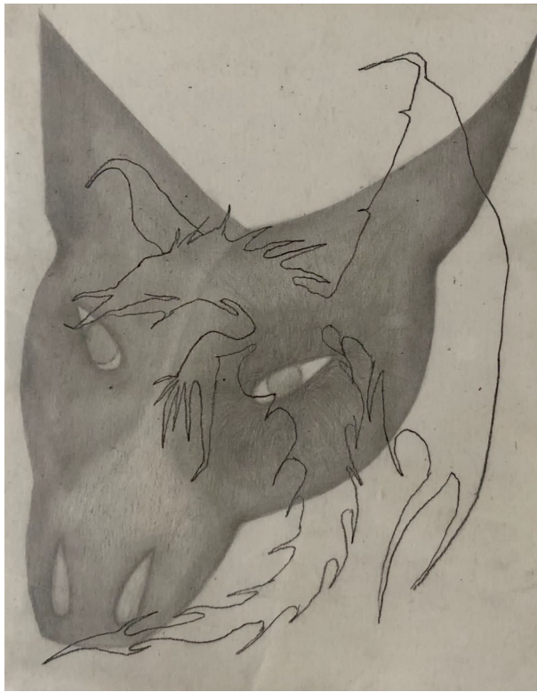
Enxhi Mehmeti, "jason", mechanical pencil on paper, 2022, 8 x 6 inch

In his 3D animations, Kırbaş evokes a society that is increasingly insensitive to the detriment of the individual. In his depictions of imaginary figures, the artist's intention is to activate the viewers' social identity and reflect upon their perception of themselves in relation to historical memory; in other words, their sense of belonging within a group with a common culture.