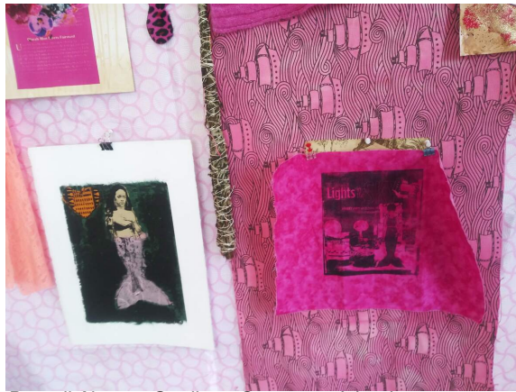
Damali Abrams Studio at Governors Island