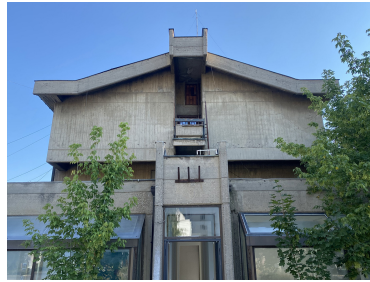
LambdaLambdaLambda², Prishtina.

the migration of fish to the cultivation and branding of new citrus varieties, and how her practice tracks seemingly natural phenomena while questioning their political and ecological ramifications.