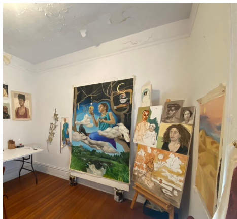
Ibtisam Tasnim Zaman Studio at Governors Island