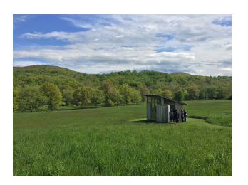
Photo credit: Shandaken: Storm King artist studio. Photo courtesy of Storm King Art Center