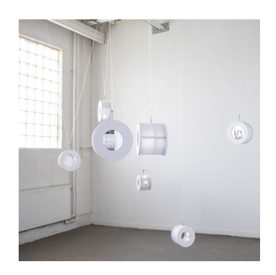
Correlation, Installation at Sculpture Space by LuLu Meng, 2022