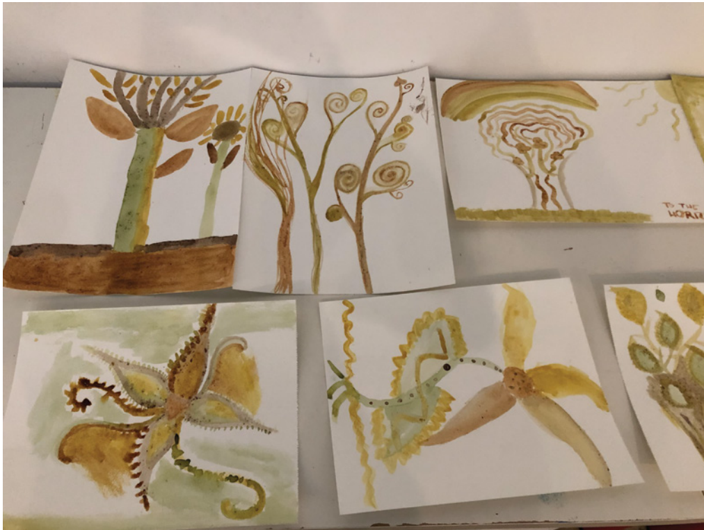
Drawings done by students during the workshop using watercolors made from natural pigments.

Led by Ana Ratner from Herban Cura the theme of the second workshop was: HOW TO CREATE THE NATURAL COLORS FROM PLANTS AND PAINTING IMAGINARY PLANTS. Herban Cura challenges urban disconnect by providing inclusive spaces of healing, learning, and collaboration. By starting from the assumption that in natural systems there is no waste, Herban Cura observes an inherent integrity present in Nature. The artists taught the students how to extract natural pigments from local and immigrant plants, and non-native ones. They then made watercolors with these natural pigments.