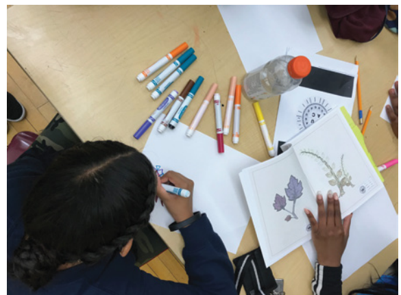
Student working on a drawing during the workshop.

The first workshop took place in Wingate High School and was dedicated to the observation of landscape. The theme was: WHAT ARE IMAGINARY PLANTS? HOW WE CAN CREATE THEM? Anne Percoco presented her herbarium project Parallel Botany (The Study of Imaginary Plants) that contains over 90 imaginary plants. Students were then invited to design their own imaginary plants and collectively create visual elements for a new herbarium. Their proposals (drawings and texts) were then incorporated into the mural.