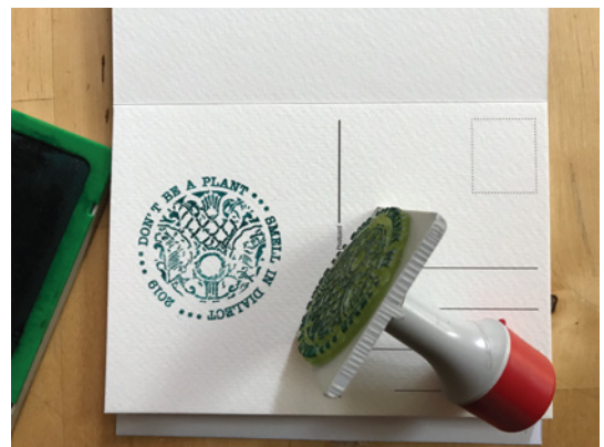
Stamp created by the artist inspired by art nouveau decoration seen above.