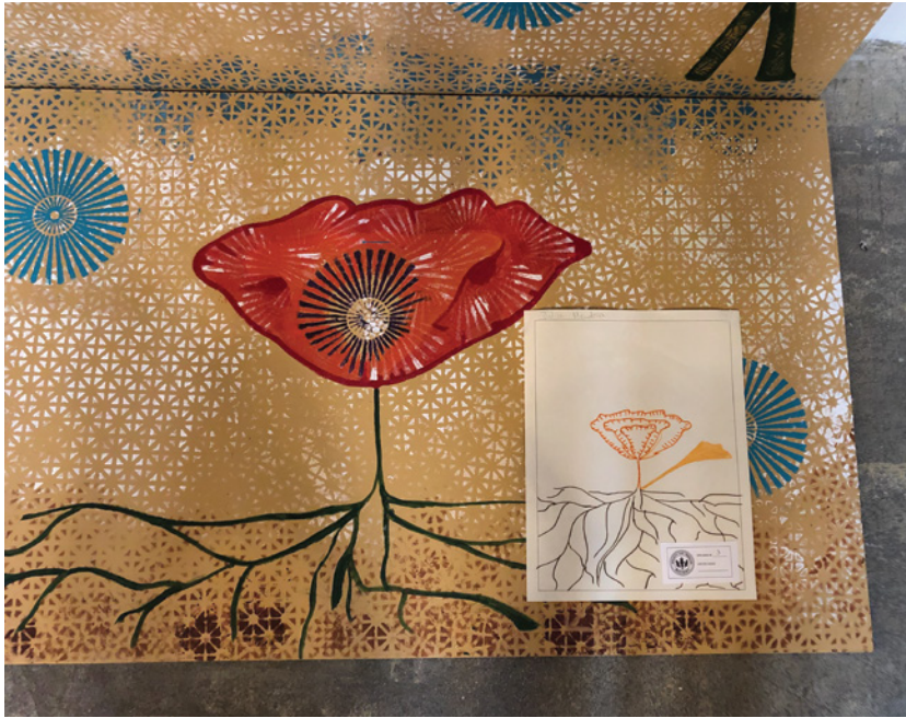
Some of the drawings done by students shown side by side with the final work.