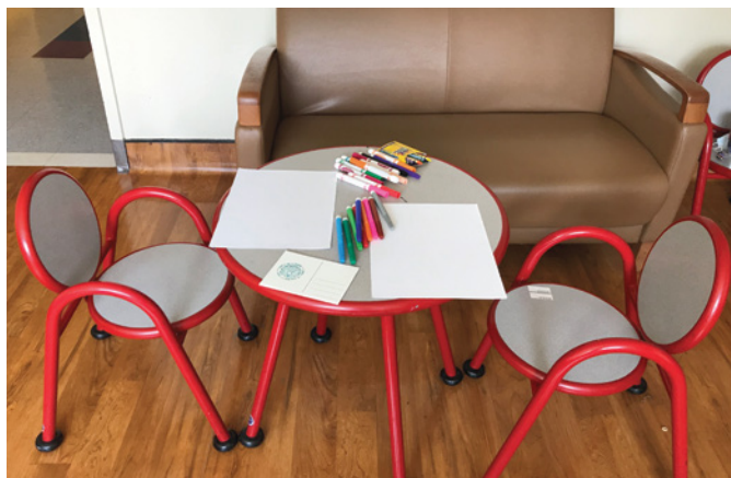
Workshop with hospitalized children at Kings County Hospital Center's pediatric unit.