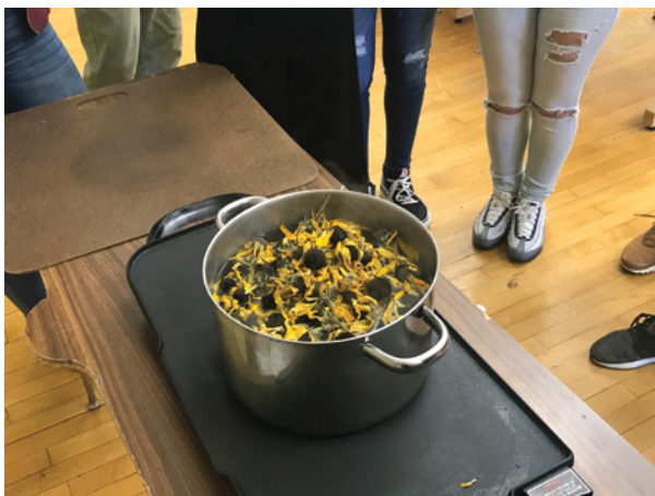
Students participate in the extraction of natural pigments later used to make watercolors and silk dye.

Led by Ana Ratner from Herban Cura the theme of the second workshop was: HOW TO CREATE THE NATURAL COLORS FROM PLANTS AND PAINTING IMAGINARY PLANTS. Herban Cura challenges urban disconnect by providing inclusive spaces of healing, learning, and collaboration. By starting from the assumption that in natural systems there is no waste, Herban Cura observes an inherent integrity present in Nature. The artists taught the students how to extract natural pigments from local and immigrant plants, and non-native ones. They then made watercolors with these natural pigments.