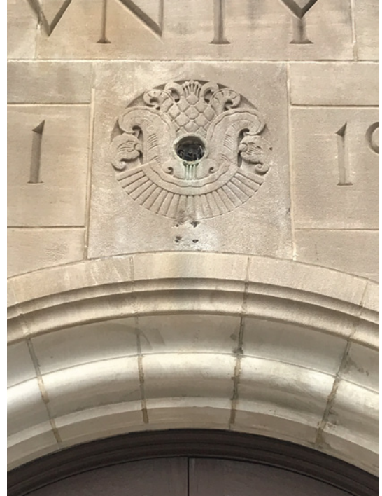
Art Nouveau decoration at King County Hospital Center's historical old entrance.