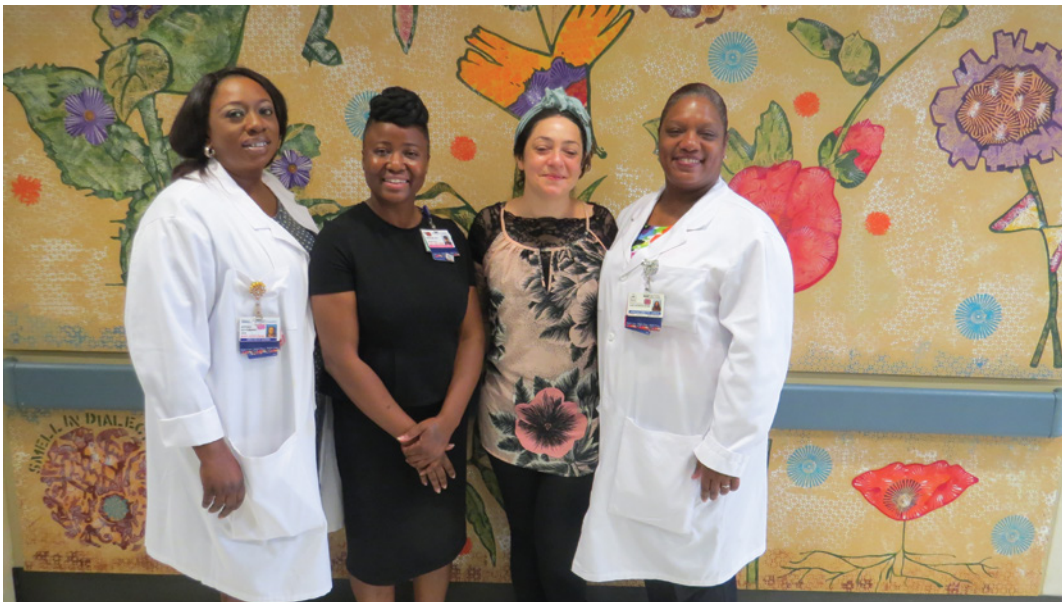
Presentation of the mural at Kings County Hospital, June 25th 2019.