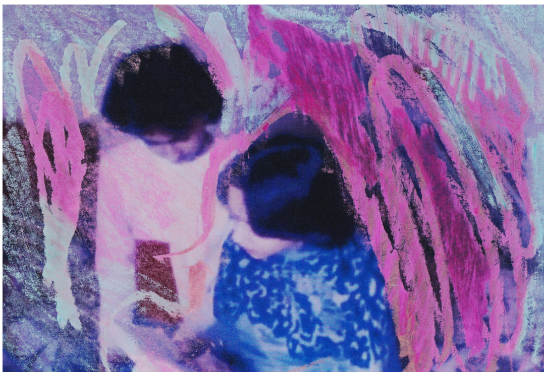
Nazanin Noroozi, Still frame from "The Riptide", 2021.