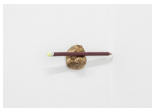
Alfredo Aceto, Bocca con Matita , (2022)