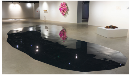
Sandra Eula Lee, Portable Pond, 2022

Slow Burn at the Phillips Museum of Art 628 College Ave, Lancaster, PA 17603 On view until April 28, 2022