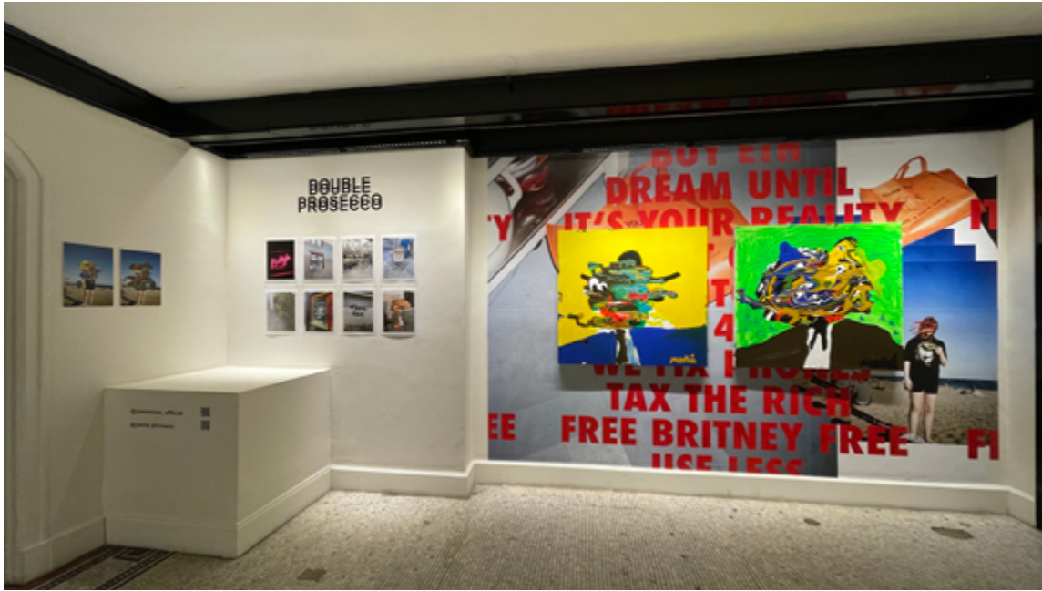
"Double Prosecco", Installation image.