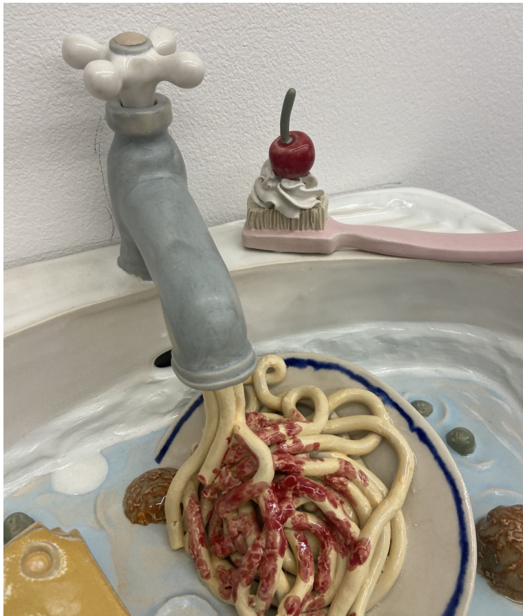
Cecilia Abeid, Spaghetti Tap, White stoneware, glazed, 2021.