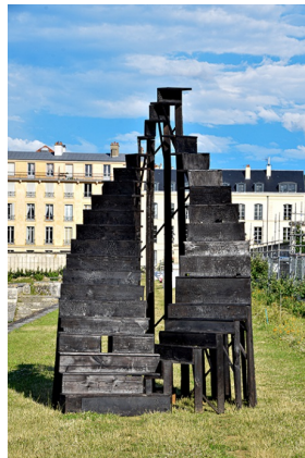
Téo Bétin, Installation ESCALIER(S)

Empty-handed Into History is RU Alum Wang Tuo's (2015) first solo institutional exhibition in China. It features eight of the artist's single- and multi-channel video works, including, in its complete form for the first time, "The Northeast Tetralogy," as well as related archival materials and sketches, presenting an overview of the artist's early-career works. Watch Interview