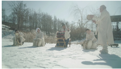
Wang Tuo, Tungus, Single-channel 4K video, color, sound, 66'00", 2021