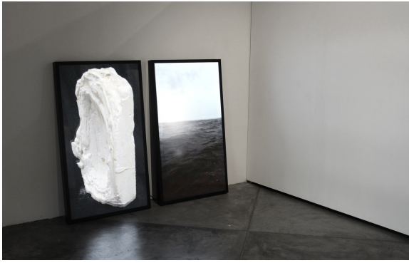
4PM Diptych video installation; LCD Screens; 2016