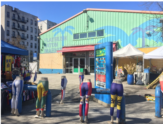
Flatbush Caton Market