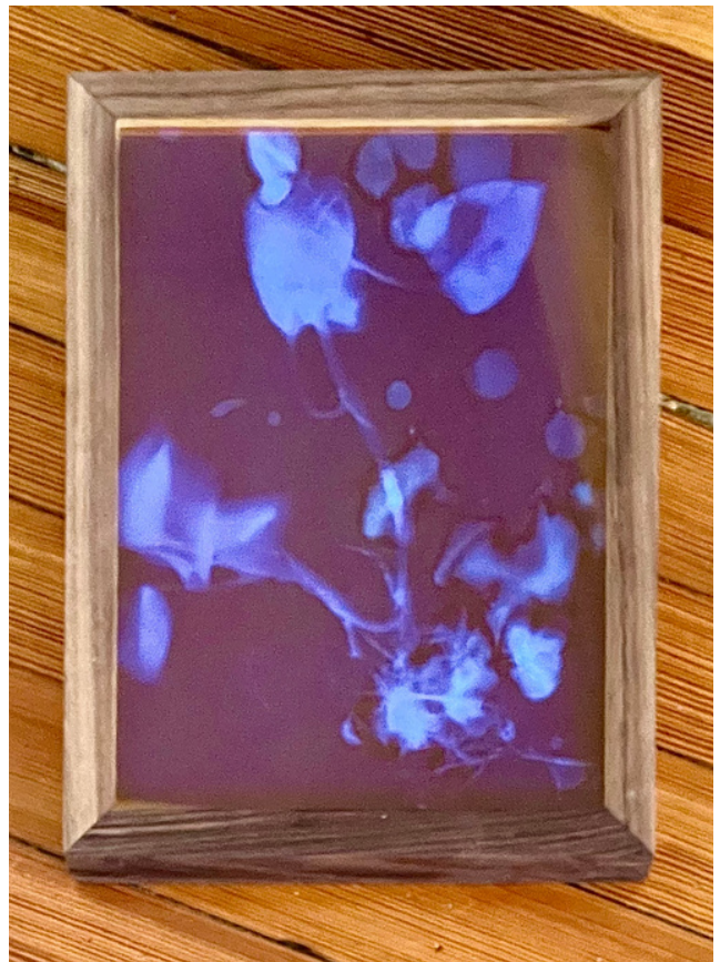
Nature doesn't exist II , cyanotype on fabric and dichroic glass, 2023.