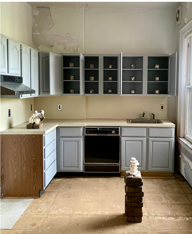
One month transformation , view of the kitchen installation 2023.