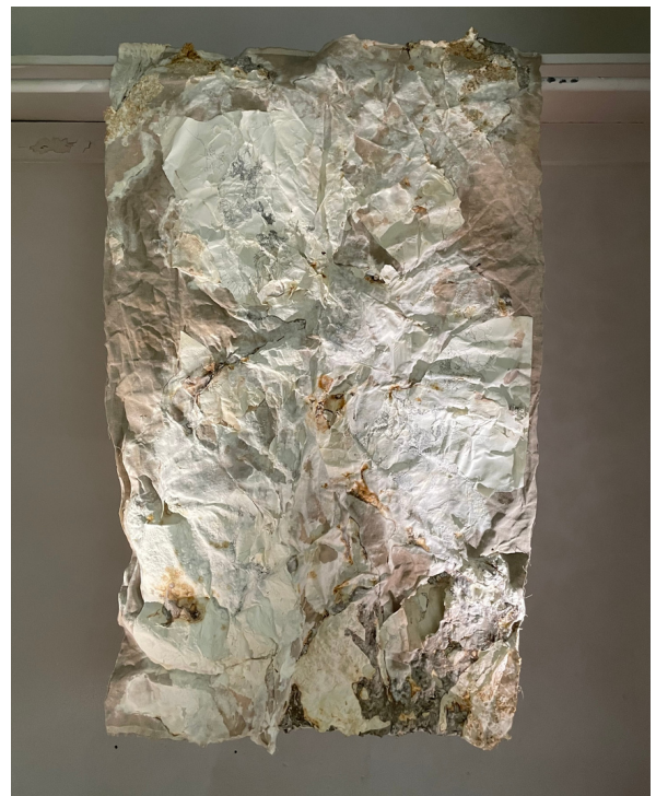
Changing matter , mycelium, ink on paper on linen canvas, 2023.