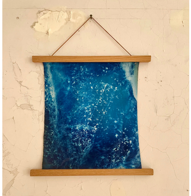
Route of exchange I , cyanotype on fabric, 2023.