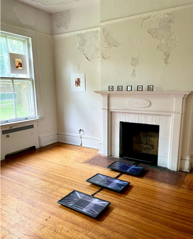
Portal , multimedia installation 2023.

Microbiologist Lynn Margulis stated in the gaia hypothesis: “the sum of all life on the planet behaves as a single integrated physiological system. The traditionally viewed 'inert environment' is highly active, forming an integral part of the Gaian system.”