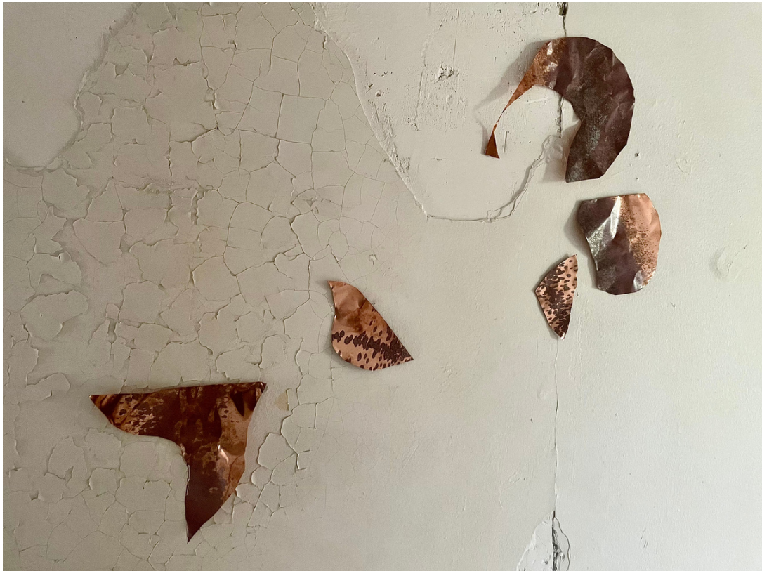
One month has passed, copper and salt, 2023

On view: Fridays - Sundays until August 27 | 11:00am - 5:00pm