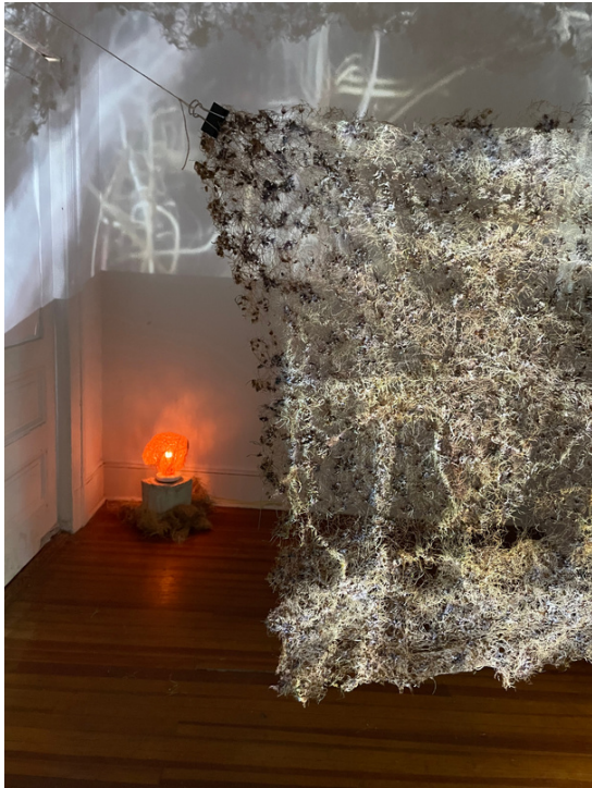
Wheat Routes , video projected on a wheatgrass root fabric, 2023.