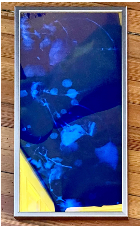
Nature doesn't exist III , cyanotype on fabric and dichroic glass, 2023.