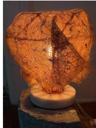
Wheat Routes , a wheatgrass root fabric on lamp, 2023.