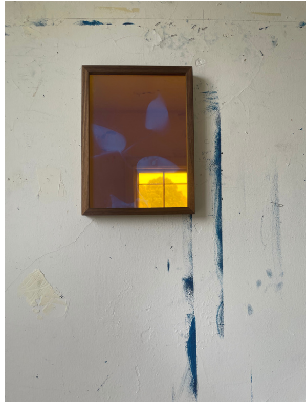
Nature doesn't exist I , cyanotype on fabric and dichroic glass, 2023.