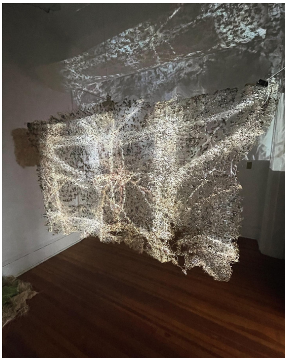
Wheat Routes , video projected on a wheatgrass root fabric, 2023.

During the final week of this evolutive show were shown artworks grown during the time of the exhibition (one month).