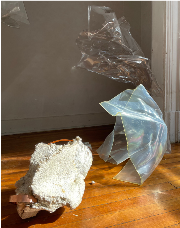
Tikkum Olam II & molds , mycelium, copper, bark, moss wood and reused plexiglass, 2023.