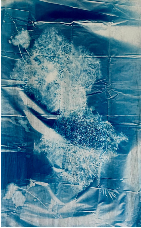
Route of exchange II , cyanotype on fabric, 2023.