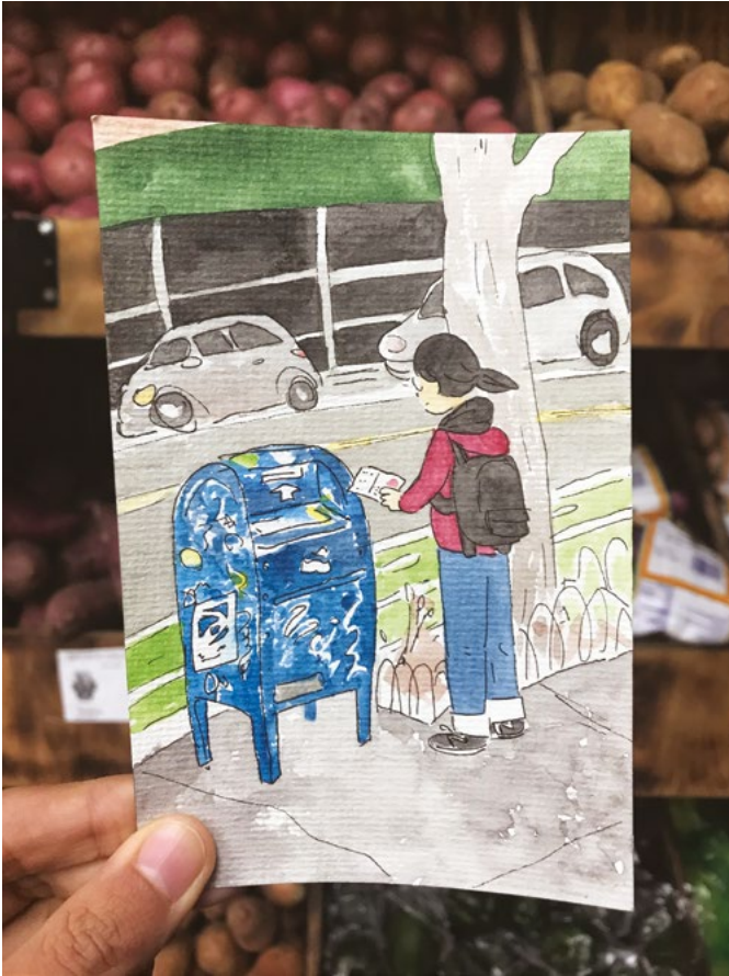
TOMOKO HISAMATSU Everyday postcards from NY to Tokyo, 2023 still from video