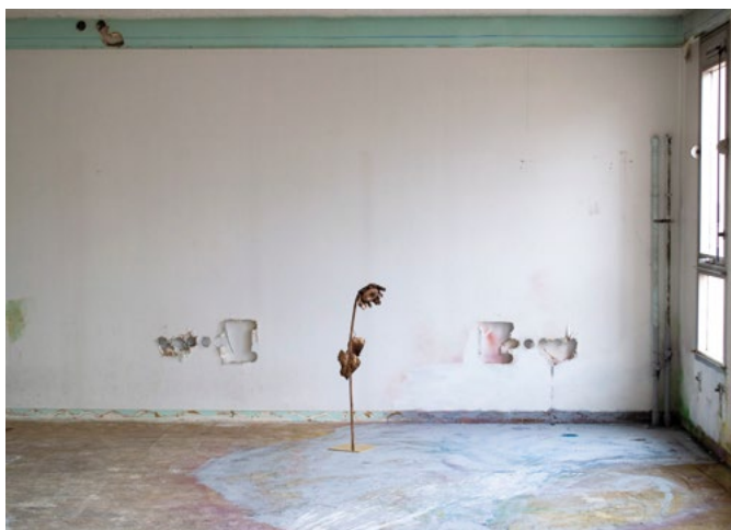
VICTOIRE INCHAUSPÉ The last to leave the party , 2023 inkjet print, 18X24 in