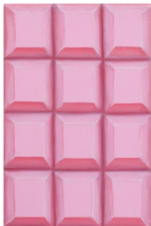
RAPHAËL-BACHIR OSMAN Matcha Chocolate, Ruby Chocolate , diptych, 2023 oil on canvas, 7x4.75 in each