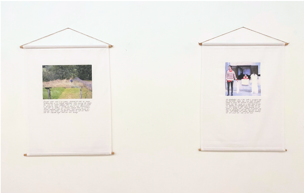
Zahida is a Feminist, two of five on view