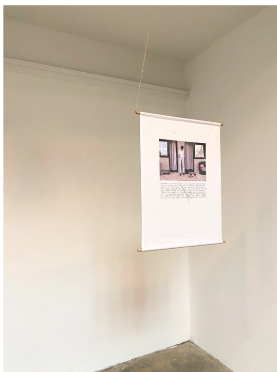
Installation view of Zahida is a Feminist