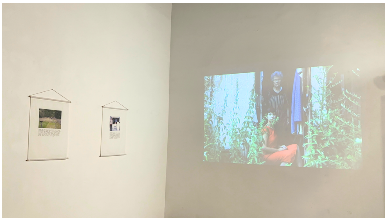
Installation shot with NENA , FILM ESSAY , 2021, on right