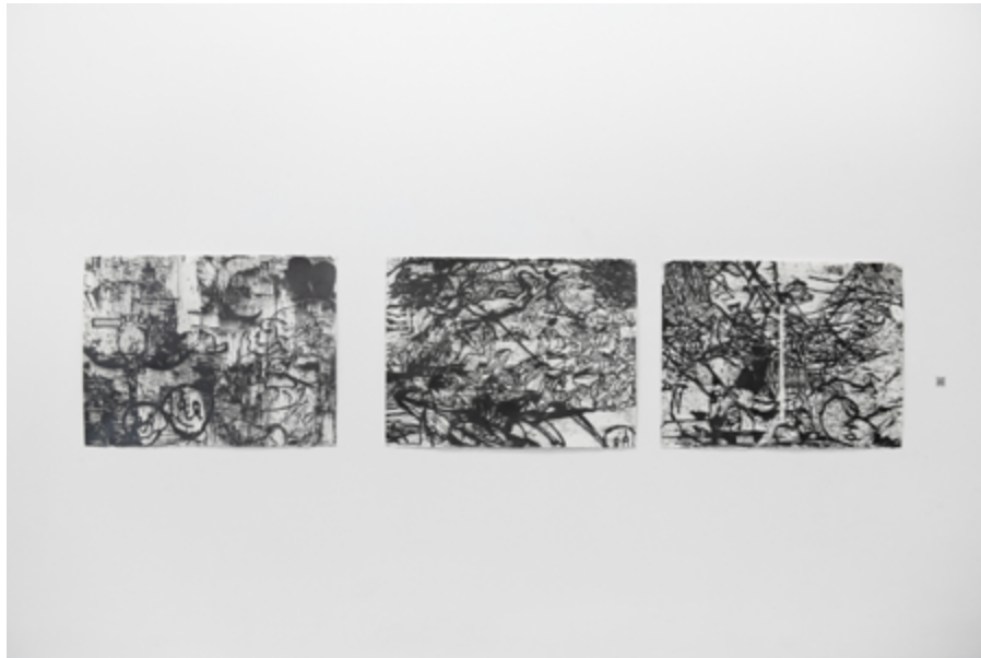
Sharon Poliakine, Silence 1, 2, 3 , Pencils on paper, 76 x 56 cm, 2021.