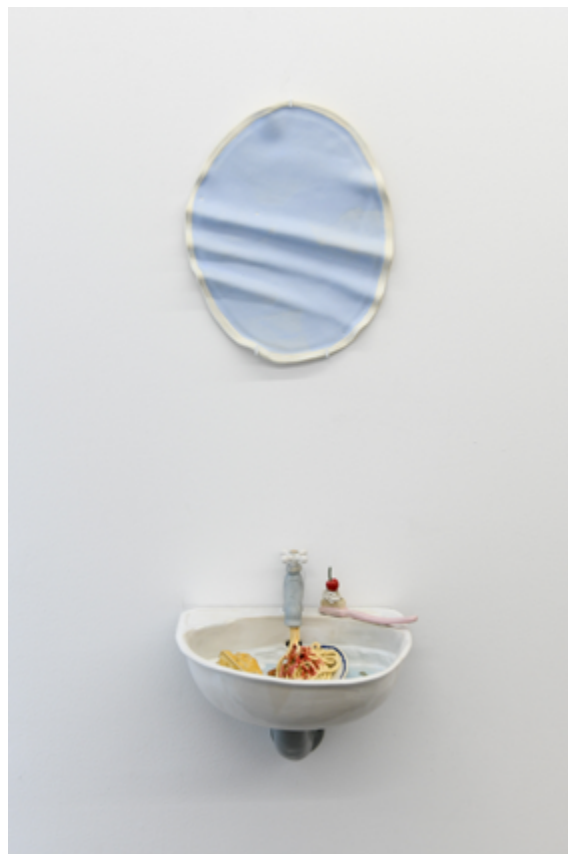
Cecilia Abeid, Spaghetti Tap , White stoneware, glazed, 8" x 12" x 14" (sink), 8" x 15" x 1" (mirror), 2021.