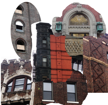
Kaichun Chiang, Williamsburg buildings, photomontage, 2016

Oct 27, 6-8pm El Museo de Los Sures 120 South 1st Street, Brooklyn