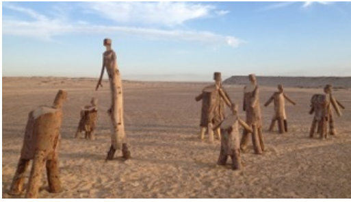
Discussion: The City Speaks: Emerging Artists from Beirut and Cairo in Conversation

July 18, 6:30pm Residency Unlimited (RU) Reservations required