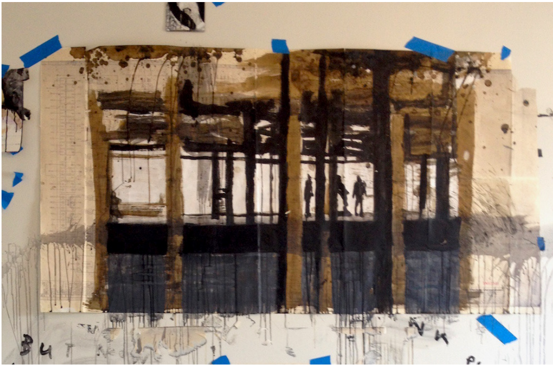
Aldo van den Broek, Untitled , 2015