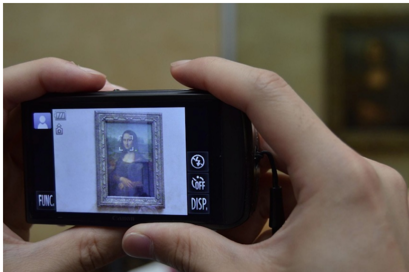
Raped Mona Lisa or Benjamin's nightmare, (fragment), 2009, mixed media